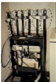
GE MASTR PRO Six-meter 1/2 MHz xmit/rcv offset repeater

Click here for Big View of MASTR PRO repeater that has been in service on 52.21 (in) 52.71 (out) north of Dallas, Tx since 1991 using the first duplexer I built. We have also built machines using all Solid State radios such as Motorola Micors on a 0.5 MHz split and a GE MASTR EXEC II on a 1 meg split with no desense using the Heliac duplexer design.